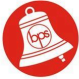
Bacton Primary School