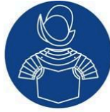
Mendlesham Primary School